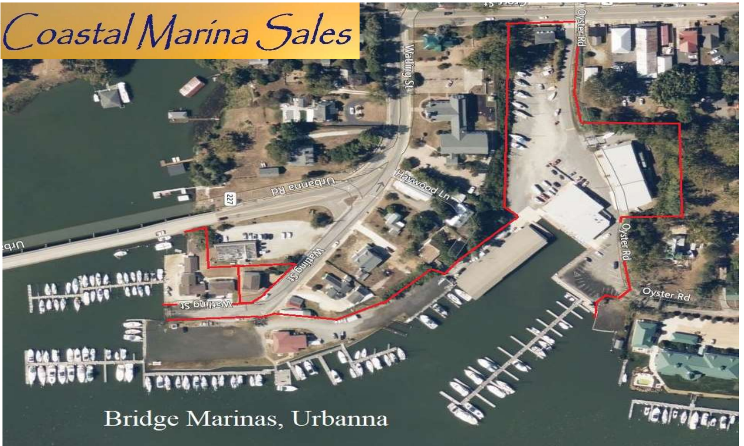
Bridge Marinas, Urbanna