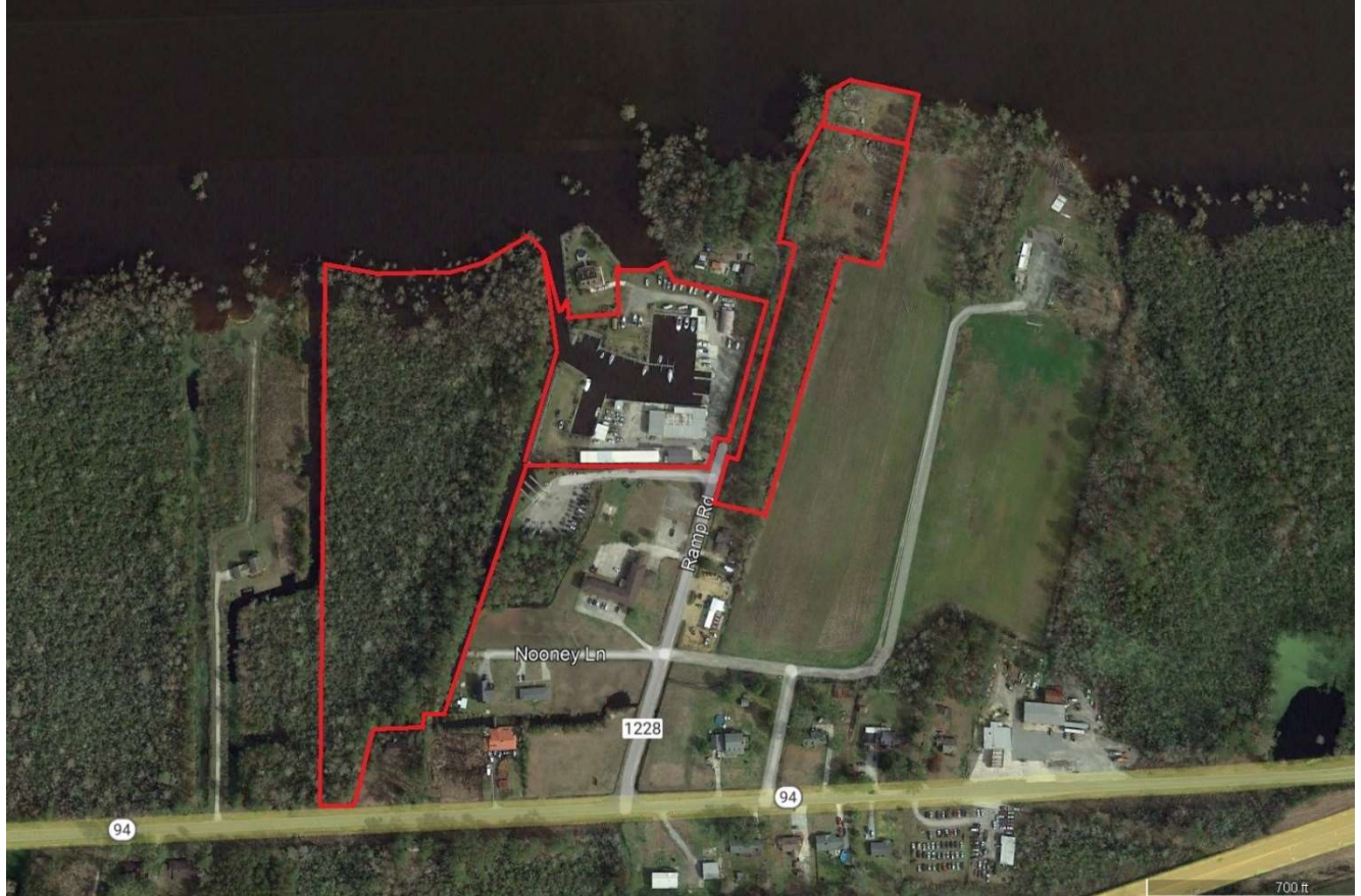
Coastal Marina Sales 1340 N. Great Neck Road, Suite 1272-120, Virginia Beach, VA 23454